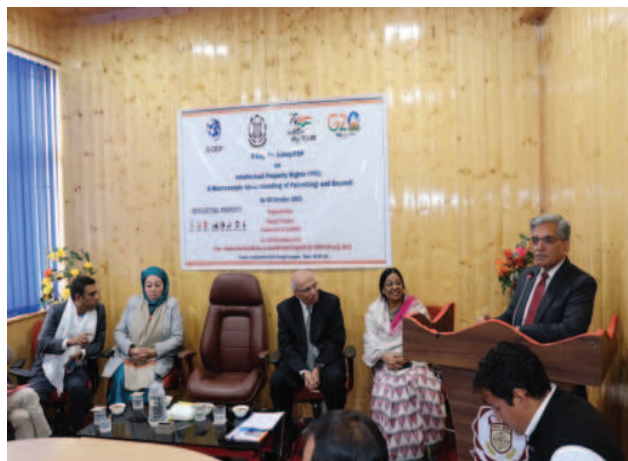
( Hon'ble Vice-Chancellor UoL speaking during the 5-day workshop on IPR. )