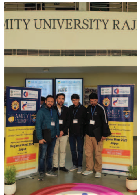
(TECUOL members attended IIC 2024 at Amity University Jaipur on 4th January 2024)