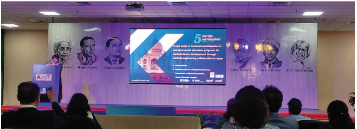
( 10th November 2023: Two members of DST-TEC UoL attended the 5th ICEHTMC in the AMTZ Campus, Visakhapatnam, at the invitation of GITAM TEC. )