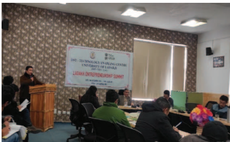
( An entrepreneur speaking during the summit. )